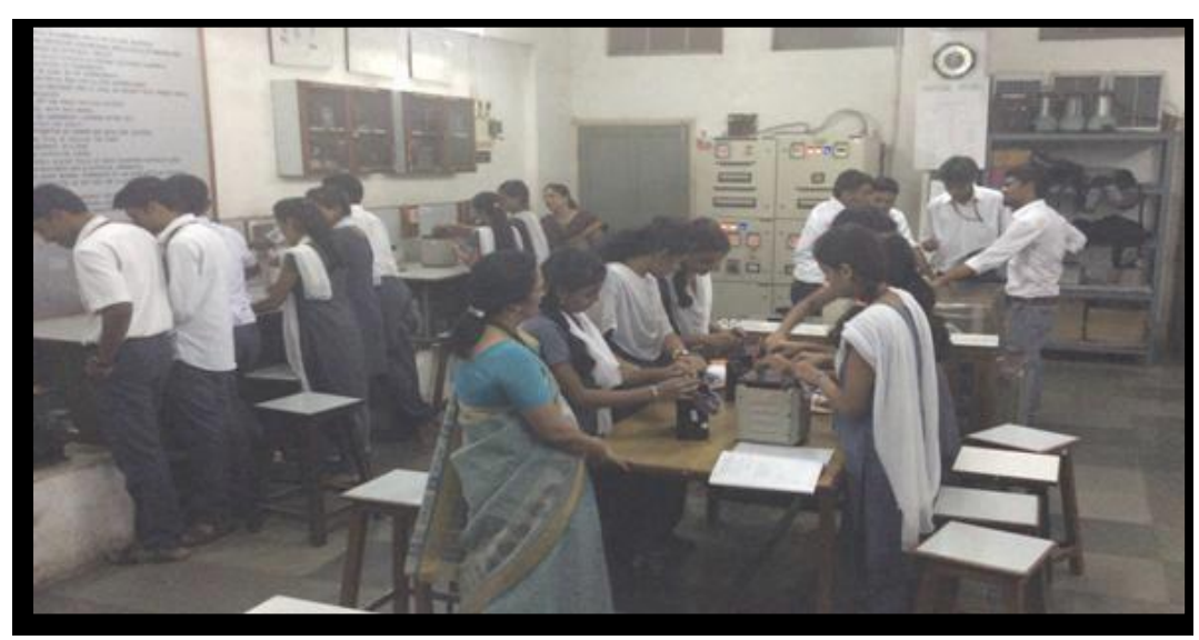
Electrical Power System Lab

Dedicated Well Equipped laboratories for every Program