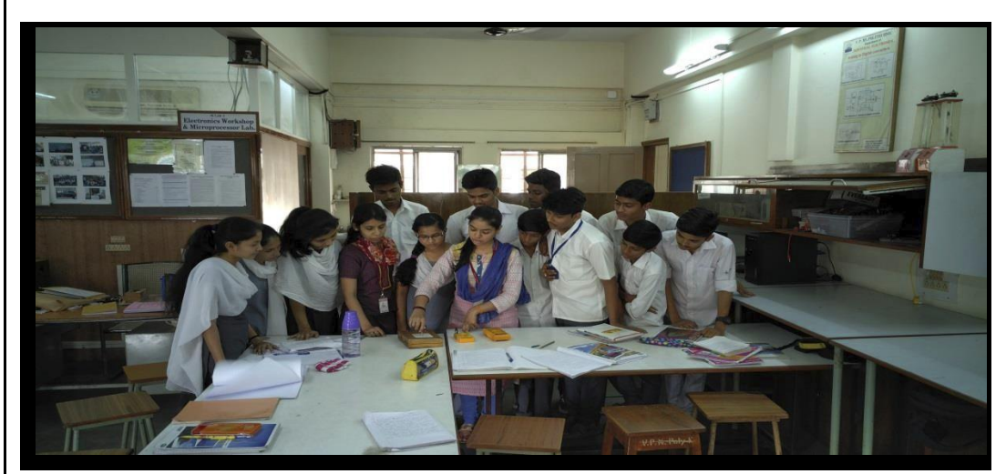
Industrial Electronics Lab