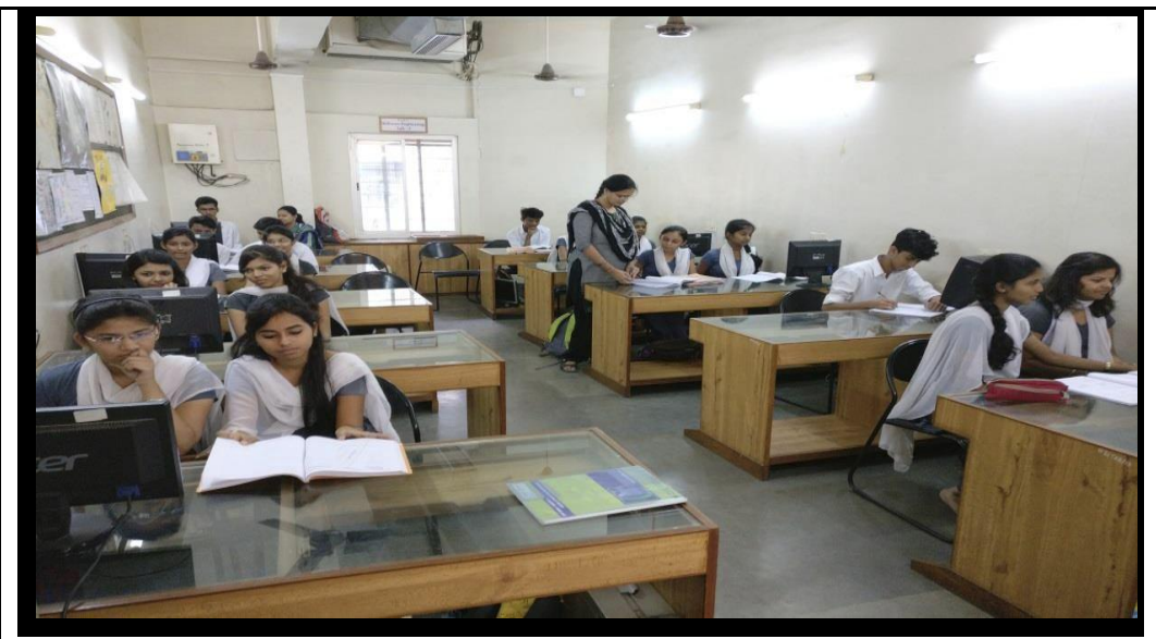
Information Technology Lab