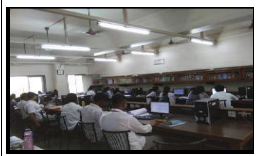
Computer Engineering Lab