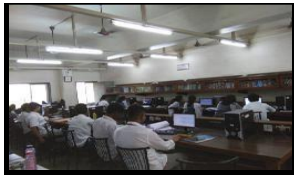
Computer Engineering Lab