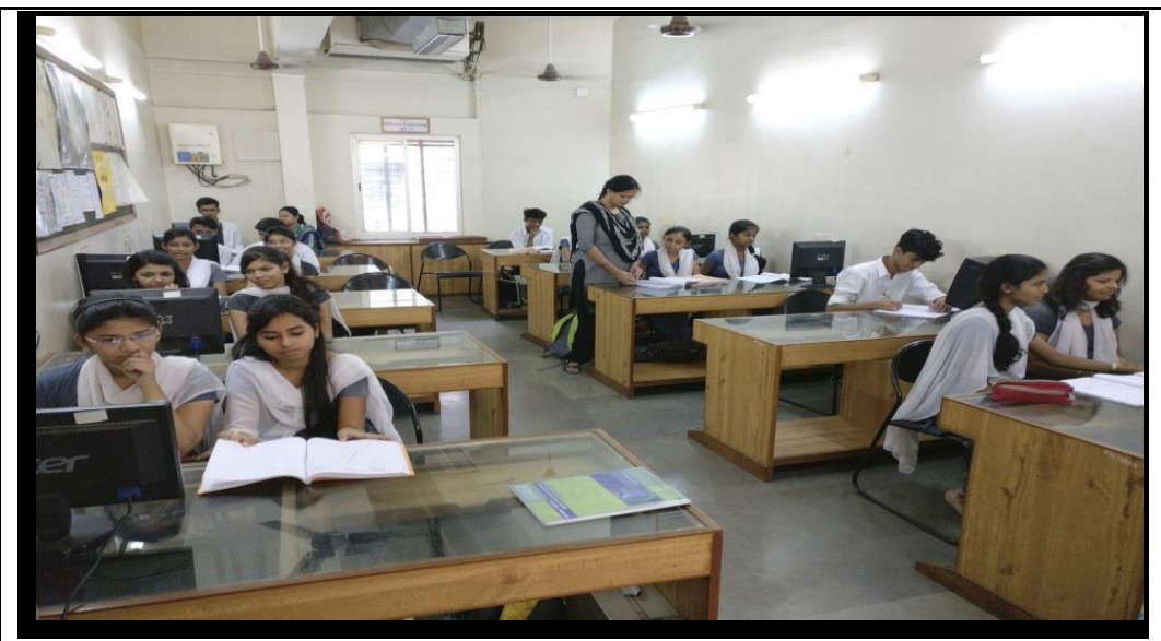
Information Technology Lab