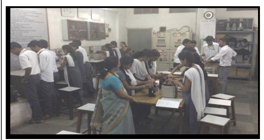
Electrical Power System Lab

Dedicated Well Equipped laboratories for every Program