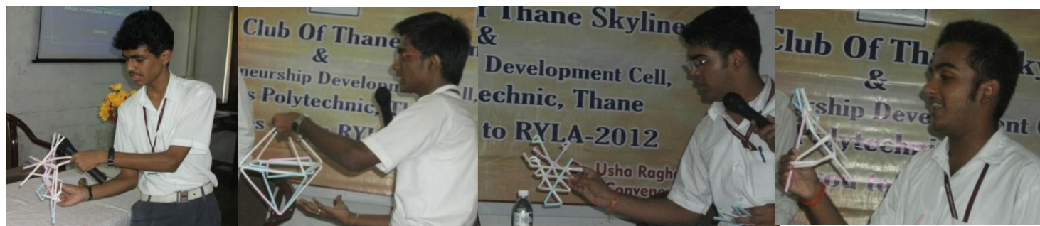
Young future entrepreneurs of the cell showing their innovative, creative products made out of straw and pins, through their team work.