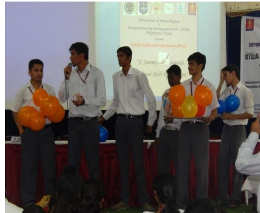
Teams building a container for the "safe egg" and sharing their experience while achieving the task.