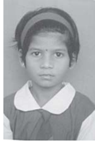
Hô. dîUdr XçgnB`

7. 1br "H$`_Yrb Hô. AmXE` XnVma øng ~pUX~i ñnY_Ü` òà$`{ i nbor. _B`P`Vg AgnigEeZ V$`ñnYm` Am`n`OV Hôbr hnrVr.