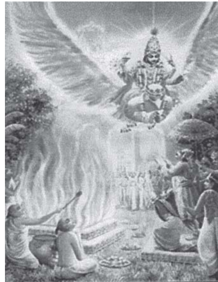
{MÌ Z$ 1

{XemA`mH$ñr edOÀ`mbd nV ""k' ømdfXH$ gñH$enZda H$ñr ZYz nZè, nrdZ H$aE`nA`m hvZo_r _n$Ur Hðor Anhod ""k' gñH$enZm, OmE`nVrb AnÜ`mpÈ`H$ d ahñ`nÈ`H$ Ane`nMm d`mOZMm "bmmbm - ZnhrgmPrbm^m, È`nda OnUrdndP$ ~n>RdÈ`ngnRè`à`EZ HðomAnho