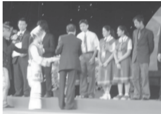
nr{aVnēfH$ ñdrH$naVmZm ^naVr` {dÚmWu

CXKnOZ AnU g_nann`mXñhr_g_nā$`nV AJXr {ZdSH$ nrñf`nZr`nDŠ`meāXnV`^mfUoHšbr. Xñhr_g_nā$`nV Hšhr ñOda ~gboZhr. nrñf`nZr`nDŠ`nV ~gbo AgV. È`nā`mZndnMmC,,d hnrVnM VñOda`V AnU H$gn_Pnē`m-ano-a bJM Annē`mOmJda OnDŠZ ~gV. ñnYV Ambo àHšēn Xd rb Cf XOnf`nV hnrVo anV ñVanda ~j gnml àHšēnM`mñnYV gh^mJr Pnbē`m hnrVo {dÚmì`nMmCēgnH AnDŠZ dñnV hnrV. Ambo àHšēn gnS`È`ngnRə VoH$`nborMoCēgnH$ hnrVo nā$w ASMU hnrV`^mfMr. anV{`_H$ AnU Cf anV{`_H$ ñVandaMr _boBŠOrV g$mfU H$ē`eH$V ZihVr. _nì`{`_H$ AnU Cf _nì`{`_H$ ñVandarb {dÚmì`nZm _mì BŠOr`W hnrV. È`nā`màHšēnV VŠknZnMmna g_nde Hšhrm Agm Mm MrZÀ`m VñH$ nVrVoVo YnVH$ hnrVo