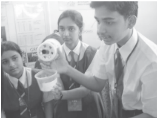
{dÚmWu àHšēn gmKa H$VmZm

dmf{dbē`m dZñVrMr {MÌ\`$V `ml arO ^naVr` àHšennMr AnUJ r Hšhr d{eīQəohnr. È`mnH$ EH$ àhUOo{dÚmì`nMmJUde. àHšennVrb Mmahr {dÚmWu emi MmJUde KrbZ nHšennMognKarH$U H$arV hnrVo È`m_wi o VoOrVgMr nē>AnU Qə eOŠKnV/bē`m BVa {dÚmì`nhZ dol i o{XgV hnrVo {dÚmì`nā_nUM gnSəgm Zgbē`m {ej Hšhr dol i mU {XgZ `W hnrVo `m H$naUnš_wi oVgM ^naVm-Ōb Agbē`m Hšhrbm_wi o ^naVr` àHšennA`m nTəgVV JXu Agm Mr. È`m JanSəgnVrb {dÚmì`nā`māiZnZmCīnaoXUohol and aM {O{H$arMoH$gn hnrVo àHšennV gh^mJr Pnbē`mMmahr {dÚmì`nZr VdH$gn_g_WfUonbo È`nZr AnnbmàHšēn EdTəgm^mdrnUo gnKa HšhrmH$ narj H$Zr Xd rb gdmf OmV di `mM àHšennOdi I M^Hšhrm Xp{MÌdntUrA`m M_zo`m {dÚmì`nMr {def`_tbl V Kd/br. ^naVr` àHšennbm AnV/aamir` ñnYV Outstanding Achievement Award XDSZ Jnp{dÉ`nV Ambo ^naVr`nā`m Nī`Zohr I and aM A{^`_nZnMr Jni>Anho