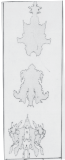
{Mİ n0>Cn{ZFX Slip No. 2

_nZgerók H$hr VHSaMVnV d {ZiHSFqH$T$VnV Vgo H$hrgo