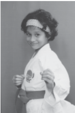
Hóì. Am` nñXnVnao

▶ h$lar` Wnma nSòè` mB$azèZb OnmZ H$anOs Agn{gEeZÀ` mAnV$ani` H$anOsñY` _btÀ` mJObV Amì nñXnVnaZoMñVñM H$`nñ$ nOñH$rdbm