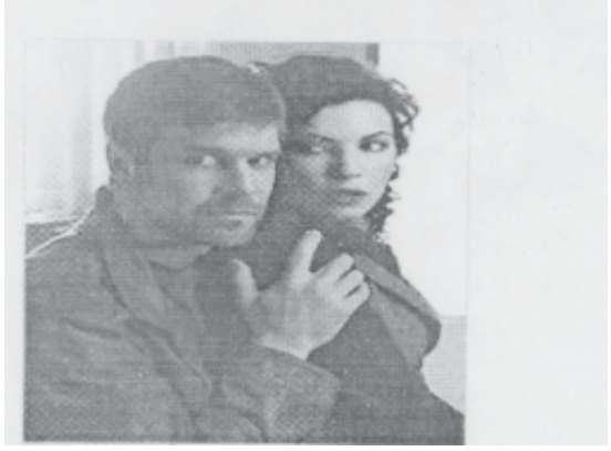
{MĪ Z$3 - Om_{ba d OqZ\sa aby

{H$, r, Ā` mđı̄ r XnZ { br` Z Sñb0Zm {dH$br OmV hñVr. VohñM hm Jñhm d I Z KSb0m.