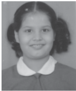
Hóì. Zbm {X{j V